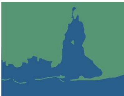
Barrier islands and river diversions