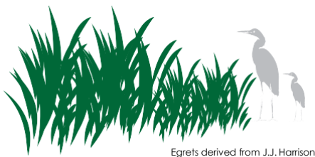
Natural resource projects